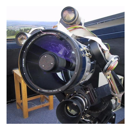
Figure 1. BART - telescope picture

Primary GRB receiving is done through dedicated client. It's connect through socket to GCN server in NASA-GSFC. If it gets a GRB event, which is currently visible, it asks central server for priority, moves the mount and after it finishes, it asks for camera exposures. Pictures from cameras are downloaded during readout through network to computer